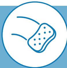
dirt & soils