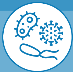
bacteria, viruses, & fungi